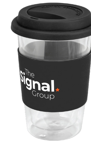
AZTEC DOUBLE WALL GLASS CUP 115064