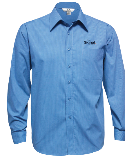
MENS MICRO CHECK LONG SLEEVE SHIRT SH816