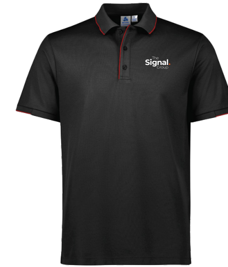
MENS FOCUS SHORT SLEEVE POLO P313MS