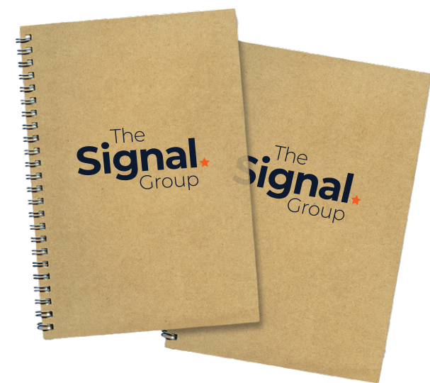
KRAFT NOTE PAD - MEDIUM 100895