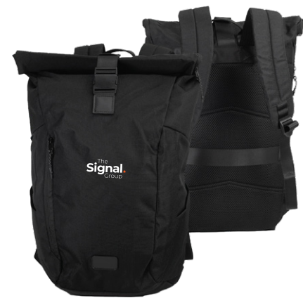
SPICE WASTE2GEAR ROLL UP COMPUTER BACKPACK 126949