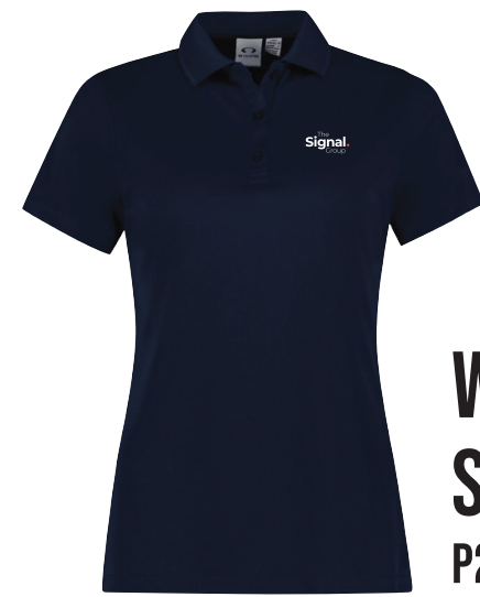
WOMENS ACTION SHORT SLEEVE POLO P206LS