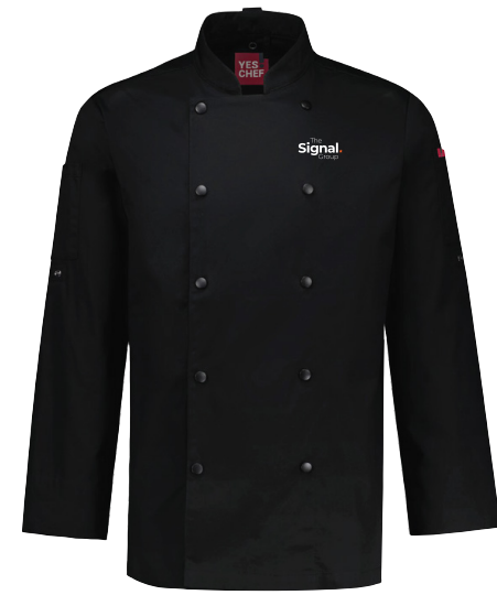
MENS GUSTO LONG SLEEVE CHEF JACKET P313MS