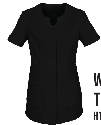
WOMENS EDEN TUNIC H133LS