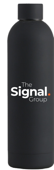
VACUUM BOTTLE JM119L