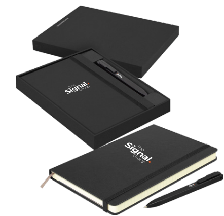
MOLESKINE NOTEBOOK AND PEN GIFT SET 119355