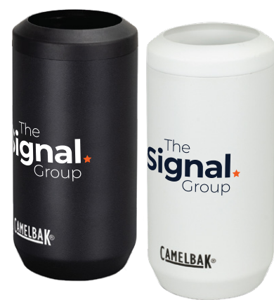
CAMELBAK HORIZON CAN COOLER MUG - 500ML 122039