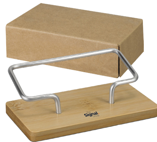
SUSTAINABLE BAMBOO BUSINESS CARD STAND 126738