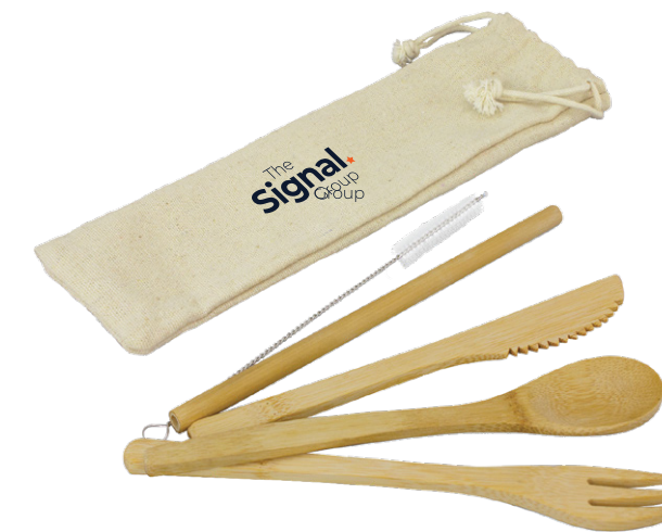
BAMBOO CUTLERY SET 117633