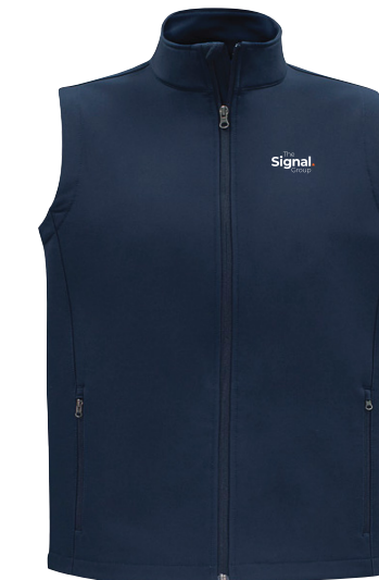
MENS APEX VEST J830M