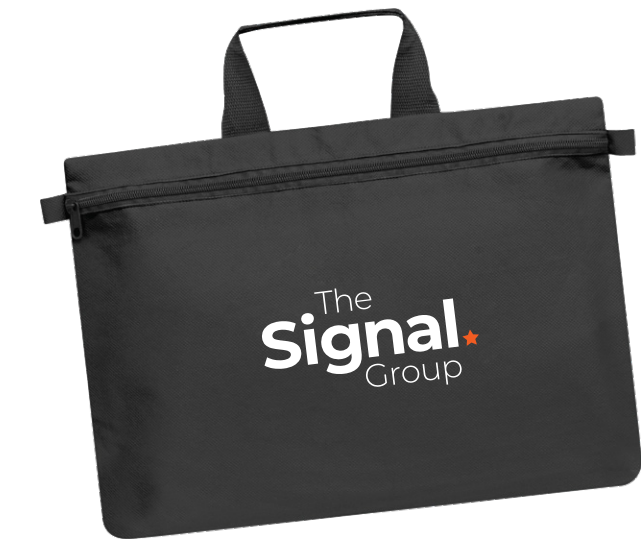
EXPO SATCHEL 107658