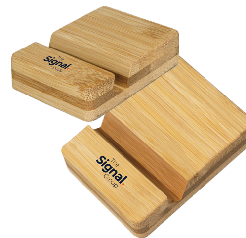
SUSTAINABLE BAMBOO PHONE STAND 120241