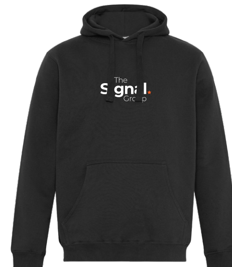
CLIPPER HOODIE OCH300