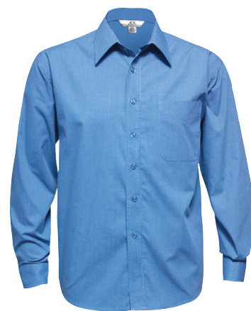
MENS MICRO CHECK LONG SLEEVE SHIRT SH816