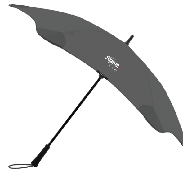
BLUNT EXEC UMBRELLA 118438