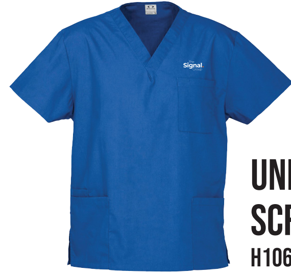
UNISEX CLASSIC SCRUB TOP H10612