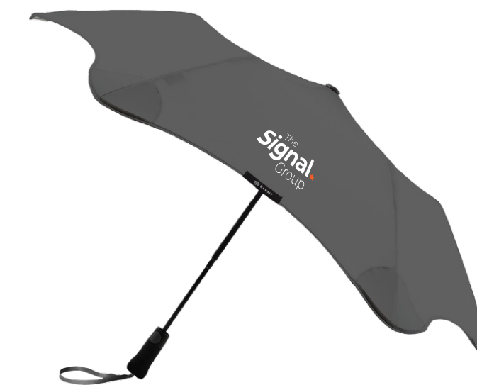
BLUNT METRO UMBRELLA 118435