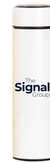
THERMAL BOTTLE JM106