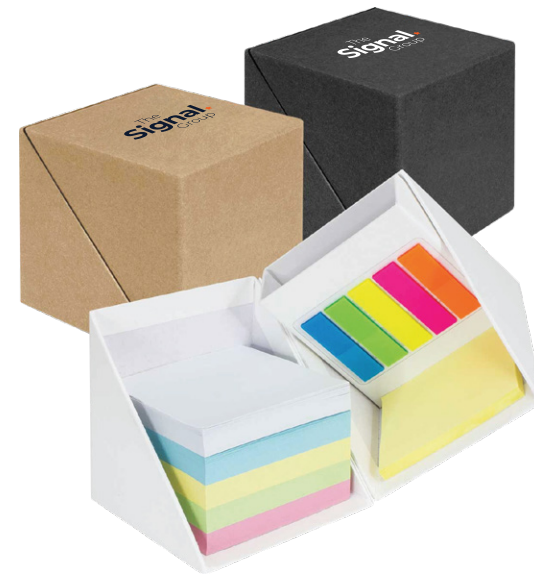
DESK CUBE 109943