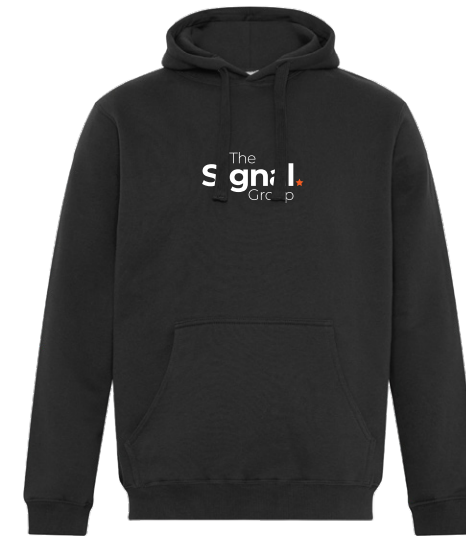
CLIPPER HOODIE OCH300