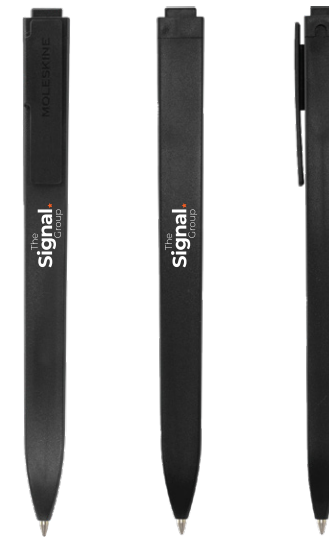
MOLESKINE GO PEN 118898