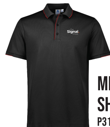
MENS FOCUS SHORT SLEEVE POLO P313MS