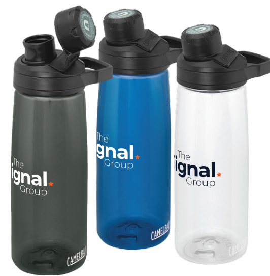
CAMELBAK CHUTE MAG BOTTLE - 750ML 118578