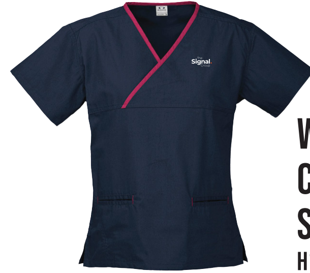
WOMENS CONTRAST SCRUB TOP H10722