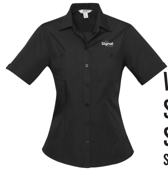
WOMENS BONDI SHORT SLEEVE SHIRT S306LS