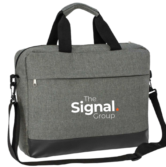
HERALD BUSINESS SATCHEL 11457