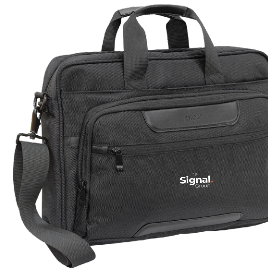
SWISS PEAK VOYAGER LAPTOP BAG 118871