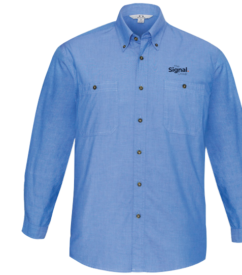
MENS CHAMBRAY LONG SLEEVE SHIRT SH112